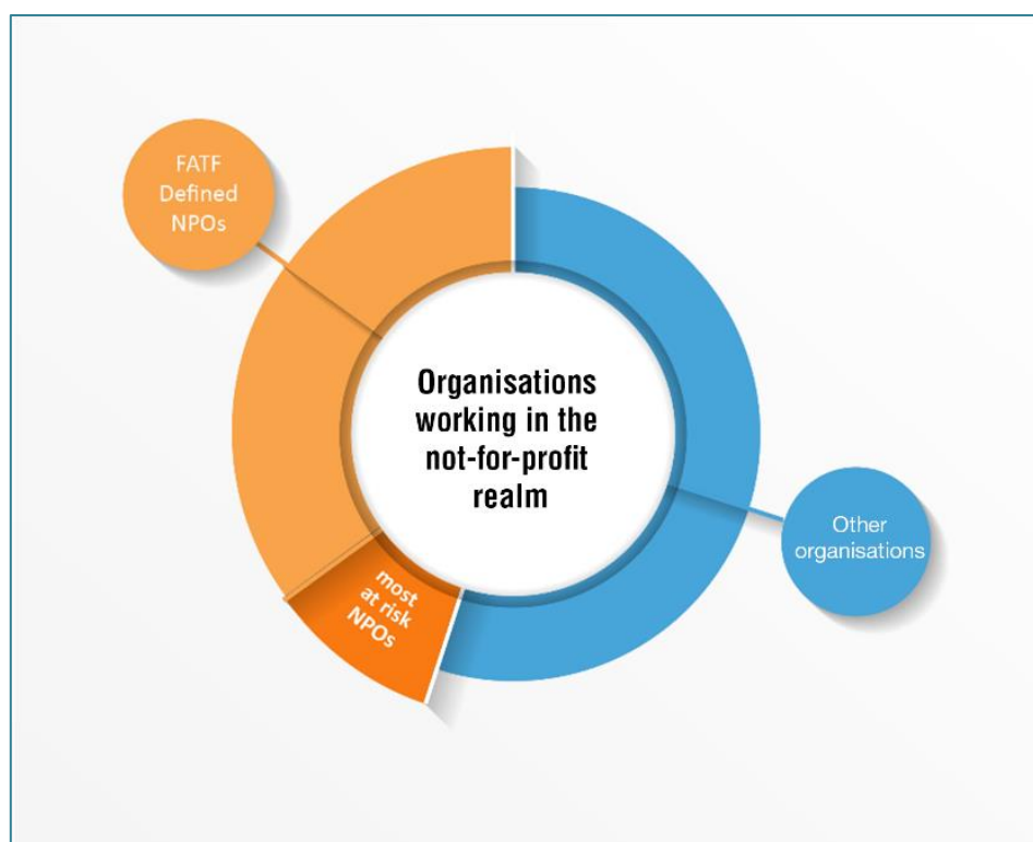
Figure Error! No text of specified style in document..2. Example of volume of most at-risk NPOs in a country's sector

Note: This figure provides an example of a jurisdiction's sector of organisations working in the not-for-profit realm. The volume of "most at-risk" NPO is small compared to the full subset of FATF defined NPOs.